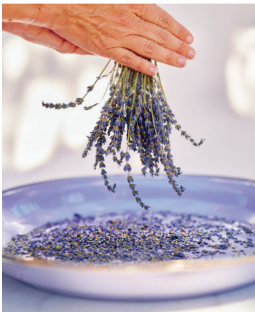
Planting, harvesting, and drying advice