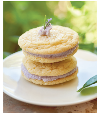
Lemon-Lavender Sandwich Cookies

“Terry Vesci has truly captured the essence of lavender.”