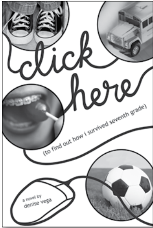
CLICK HERE (to find out how I survived seventh grade) 978-0-316-98559-8