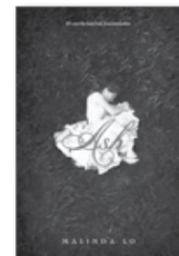
978-0-316-04010-5 Morris Award Finalist