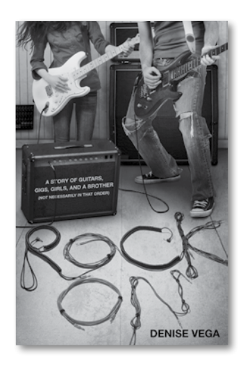
ROCK ON: A Story Of Guitars, Gigs, Girls, and a Brother (not necessarily in that order)