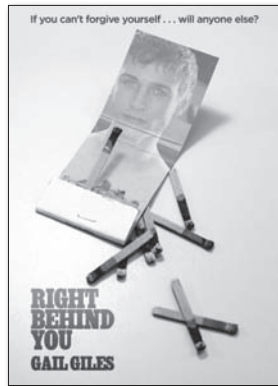
Right Behind You 978-0-316-16636-2 HC 978-0-316-16637-9 PB