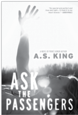
ASK THE PASSENGERS by A.S. King 978-0-316-19468-6

Astrid Jones desperately wants to confide in someone, but her mother's pushiness and her father's lack of interest tell her they're the last people she can trust. Instead, Astrid spends hours lying on the backyard picnic table watching airplanes fly overhead. She doesn't know the passengers inside, but they're the only people who won't judge her when she asks them her most personal questions...like what it means that she's falling in love with a girl.