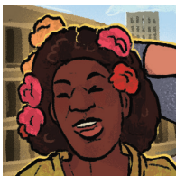
MARSHA P. JOHNSON