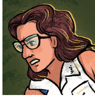
BILLIE JEAN KING