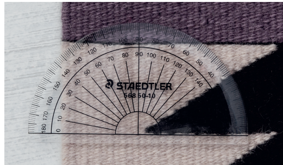
▲ You can use a protractor to measure the size of the angle in degrees between the horizontal and diagonal lines.