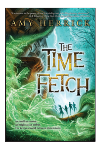
MIDDLE-GRADE HARDCOVER FICTION

"Analyze how and why individuals, events, or ideas develop and interact over the course of a text."