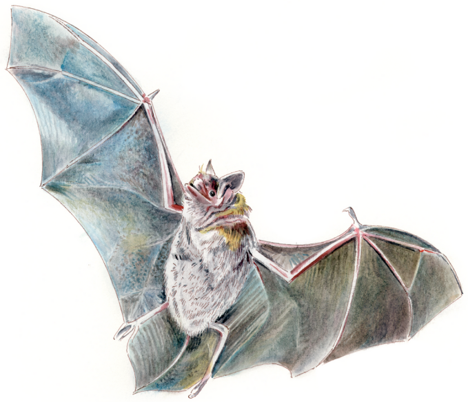
Little Brown Bat