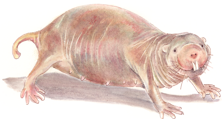
Naked Mole Rat