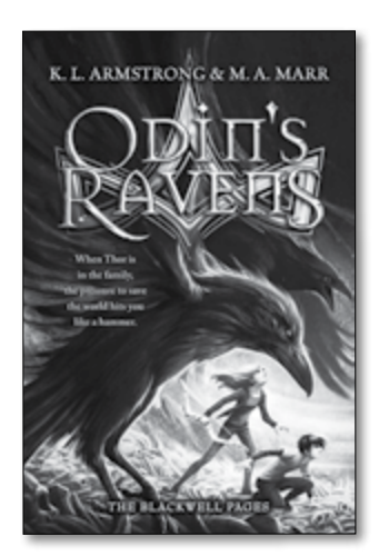
Odin's Ravens by K.L. Armstrong & M.A. Marr

HC 978-0-316-20498-9 Also available as an eBook and in a downloadable audio format